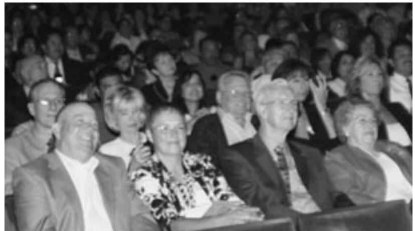
Many graduates emphasized how important the support of family and friends was to their success in law school.