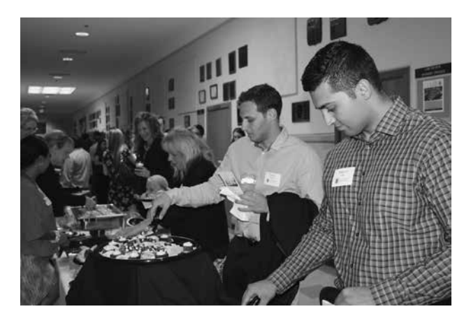
Mixin' and minglin' at the Dean's Reception