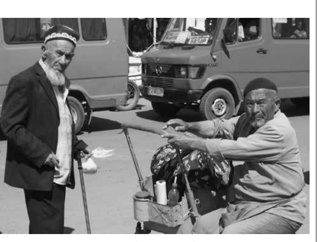
Uzbek men in Osh, Kyrgyzstan.

Borgeas' article selectively examines America's record of investment and particular interests worth monitoring in individual Central Asian states, regional and state specific challenges and tools that can help promote more regional stability. The article provides focused policy recommendations: that to promote greater stability in Central Asia, US policymakers should emphasize economic development through greater regional and global market integration, support regional cooperation alongside evolving notions of state sovereignty, and encourage policies to address the political, social and religious grievances that give rise to Islamic extremism. The article concludes that for lasting stability the US must remain actively engaged in Central Asia, and can accomplish