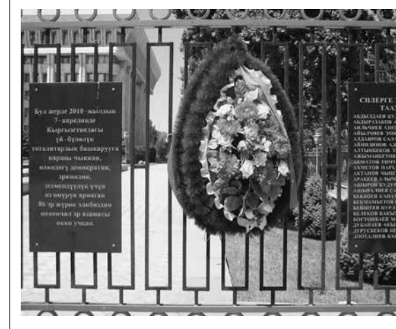
Plaques honoring those who died in 2010 Kyrgyz Revolution, White House in Bishkek, Kyrgyzstan.

Other recent publications by Professor Borgeas include Islamic Militancy and the Uighur of Kazakhstan: Recommendations for U.S. Policy, Yale Journal of International Affairs (2013); Security Relations Between Kazakhstan and China: Assessments and Recommendations on Select Transnational Questions, Columbia Journal of International Affairs (2013) and The Evolution of Greece's Security Legislation and Policy, Saint John's Journal of International and Comparative Law (2013).