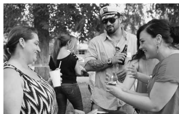
Back to School and a birthday too!