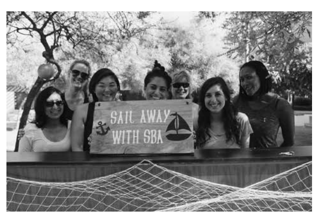
The Student Bar Assocation prepares for the annual Back to School BBQ with a nautical theme.