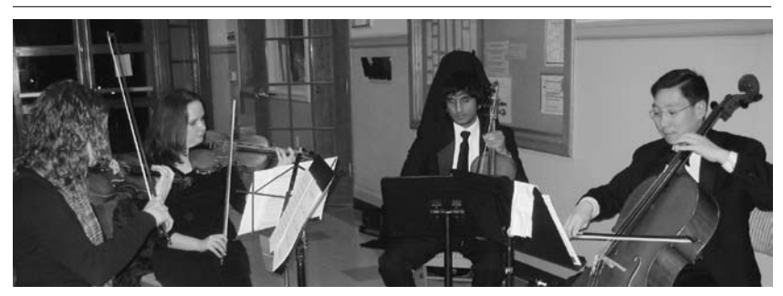
Fresno Pacific University String Quartet

dream. Through giving of their time, talents and treasure, SJCL was born and has grown into what it is today. I want to encourage all who have benefited from receiving their legal education at SJCL to recognize what others gave to provide that opportunity and recognize that but for their gifts, that opportunity wouldn't have existed. Begin, and continue to give, that others