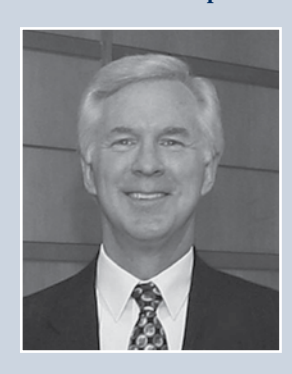
Honorable Lawrence O'Neill U.S. District Court for the Eastern District of California