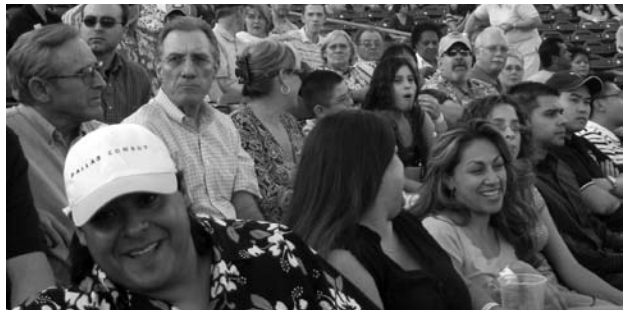
SJCL's alumni and friends look on as the Fresno Grizzlies beat the Tacoma Rainiers 6 to 3.