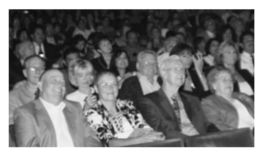
Many graduates emphasized how important the support of family and friends was to their success in law school.