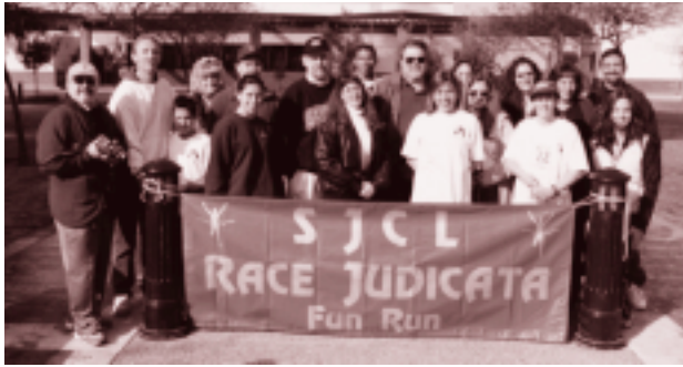
Thanks to all the volunteers who worked the race.