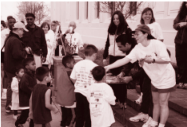
Awarding of participation ribbons.

permanently endow the Judy Wiseman Scholarship. Contributions can be made to the SJCL Student Bar Association for benefit of the Judy Wiseman Scholarship.