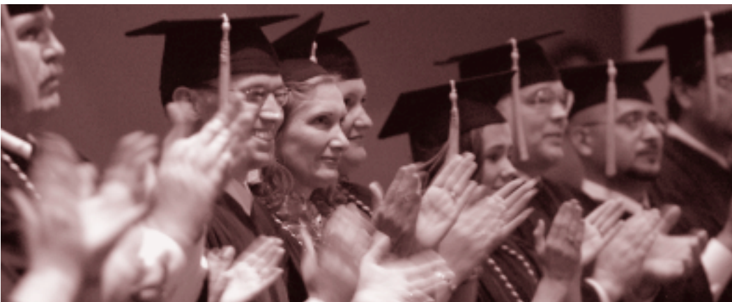
Class of 2003 applauding their valedictorian