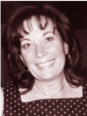
Brenda Linder Woman Lawyer Scholarship