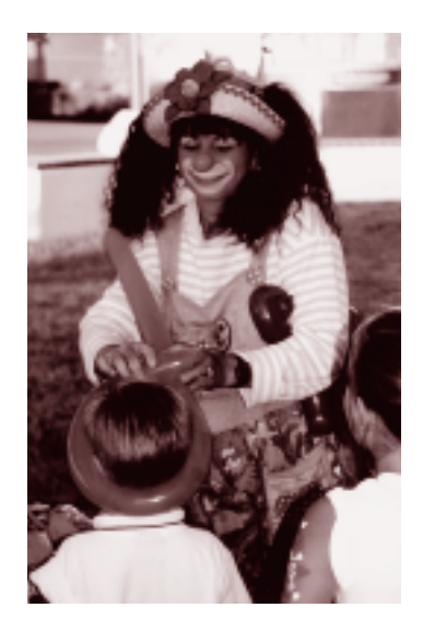
"Tootie the Clown" creates balloon animals for students and their children.