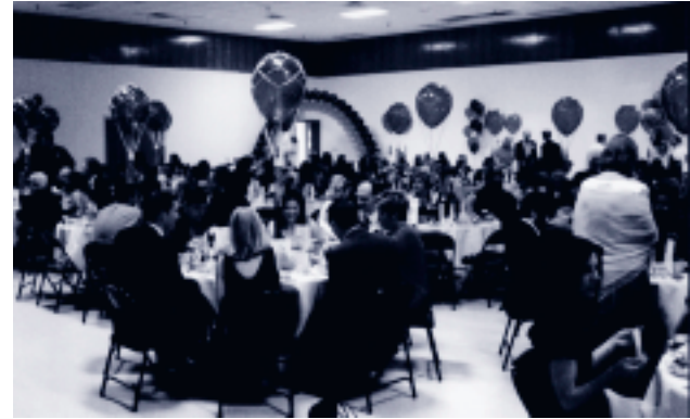
Over 200 people attended this year's Spring Banquet.