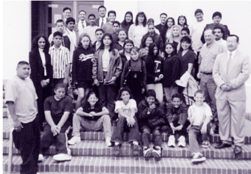
Forty children from Allensworth School participated in the mock trial

The children who participated worked on the scripted mock trial for several days. Their hard work showed as the kids performed impressively in the courtroom. The case was civil conversion. It was up to the students to decide which strategy was best to get a verdict in their favor. Allensworth school was selected to