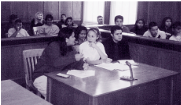
Counsel for the plaintiff confer before giving their final argument.

A few days after the mock trial, La Raza received many letters from the children indicating their desire to become lawyers. Most of the children thought the experience was a lot of fun and really cool. La Raza Law Student Association recognizes that when people are put in a position to influence others in a positive way, especially young children, it would be wasteful not to seize the opportunity.