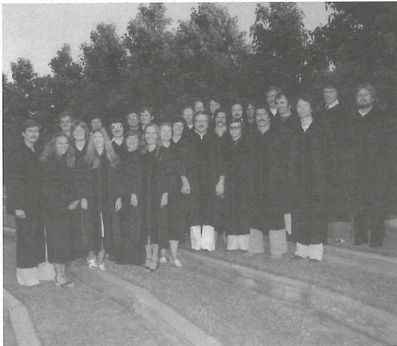
The Class of 1978 stands proudly following their graduation. This style of a "group class shot" was common in the early years of SJCL graduation photos.

County Women Lawyers, and has volunteered with Fresno Unified School District's Mock Trial and the Cerebral Palsy Association's VIP Program. She serves as President of Opportunities Plus. In 1992, she was named the Boss