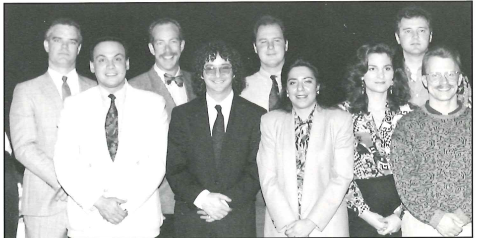
The SJCL Moot Court team at this year's National Environmental Advocacy Competitions.

Law, National University School of Law, Gonzaga University School of Law, Western State University School of Law and the University of LaVerne College of Law. ■