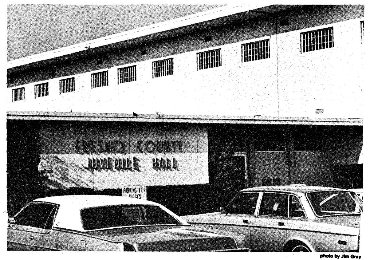
Fresno County Juvenile Hall: For the Detained Minor It's Still Time.

Non-Profit Org. U.S. POSTAGE PAID Fresno, CA Permit No. 721