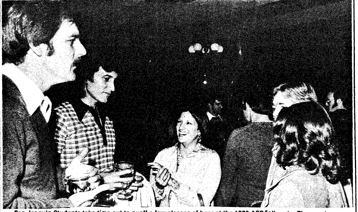
San Joaquin Students take time out to quaff a few glasses of beer at the 1975 ASB fall party. The event was held in the Stein Room at the Silver Dollar Hofbrau and sponsored by the San Joaquin Associated Student Body.