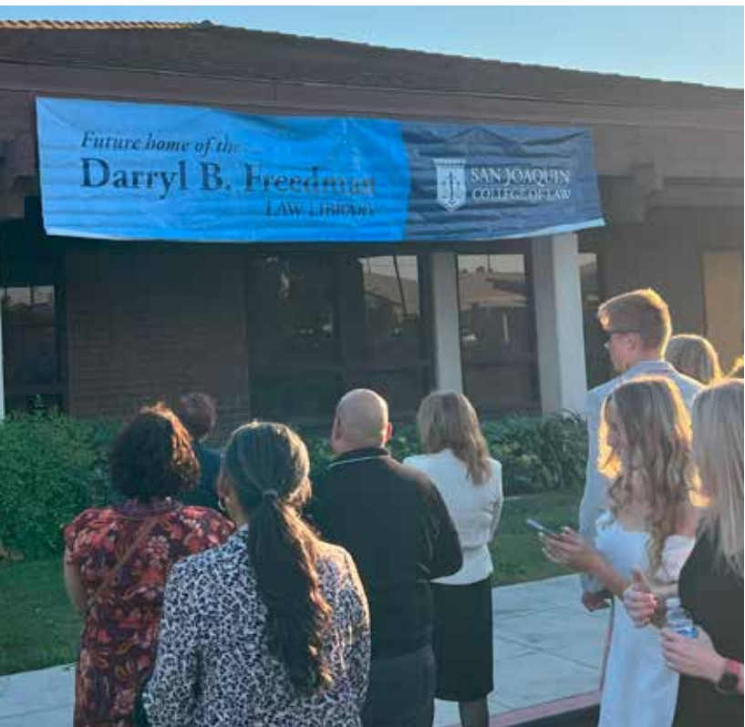
A banner introducing the name of the new law library was unfurled during the event. Once the renovations are complete, a permanent sign will adorn the building.