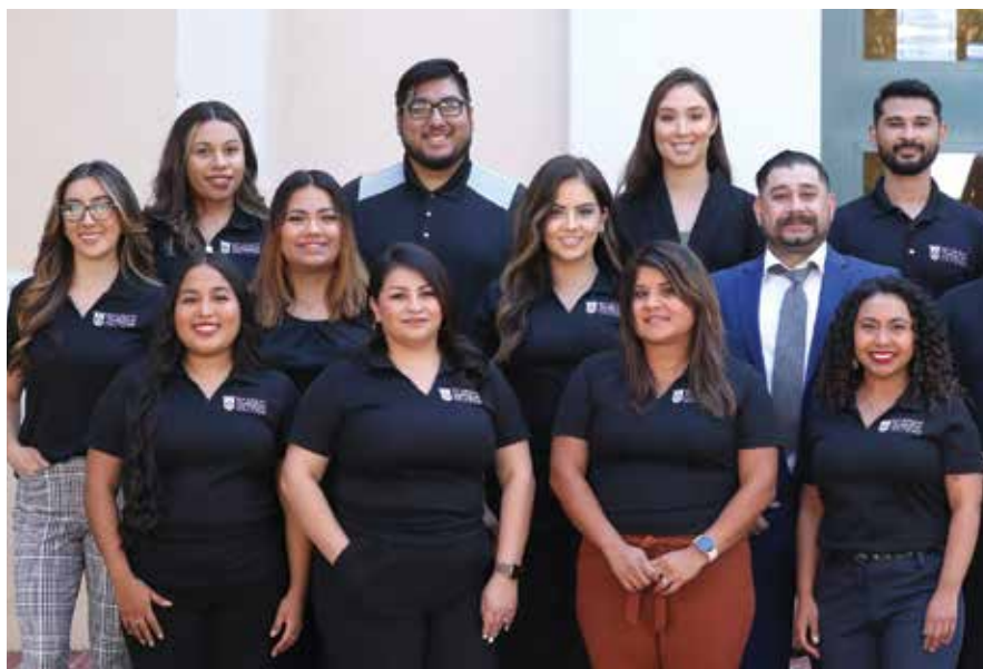
The team at SJCL's NALC has built a stellar reputation for serving the immigrant community.