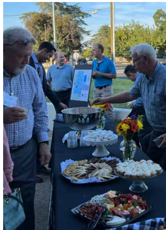
Goodies and champagne punch added to the festivities.