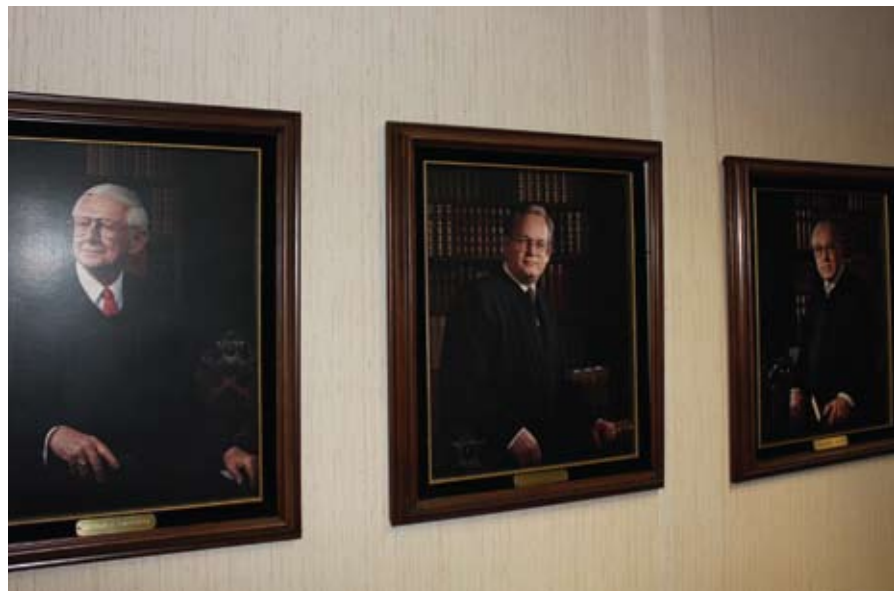
“Wall of Judges” at Wild, Carter & Tipton. A half-dozen attorneys from the firm have become members of the bench