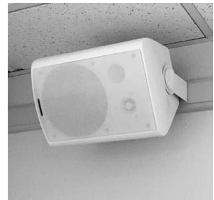
Wall mounted stereo speakers.