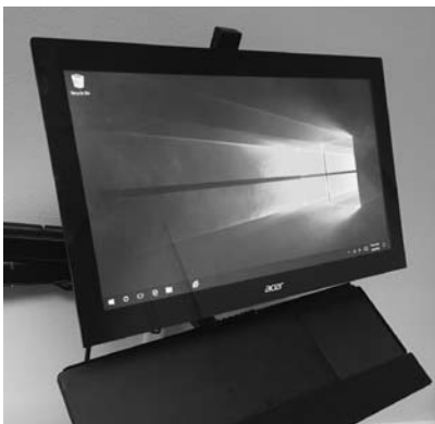
Wall mounted computer with touchscreen display, wireless keyboard, and mouse.