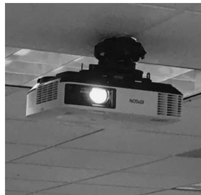
High resolution ceiling mounted projector.