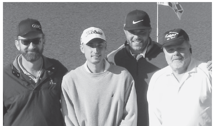
2014 FIRST PLACE TEAM (L-R):

Central California Bankruptcy Association