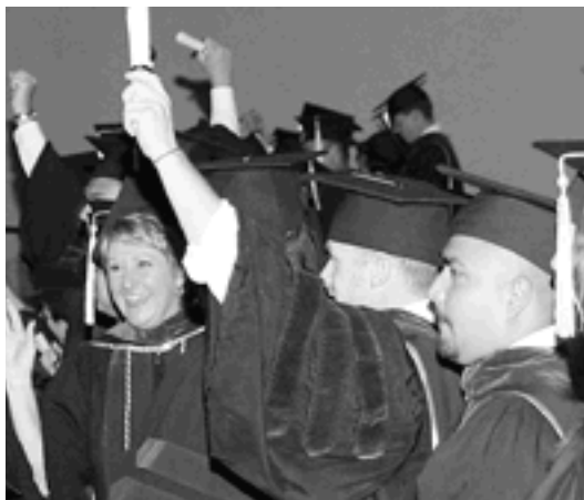
They all cheered!