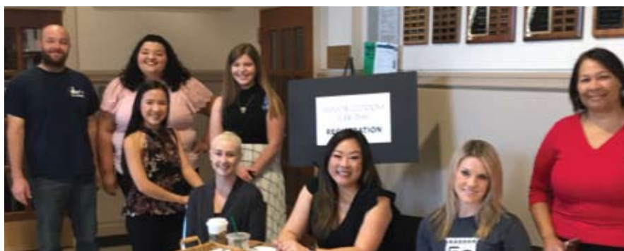
Alumni Association Board members and student volunteers work together at Senior Citizens' Law Day.