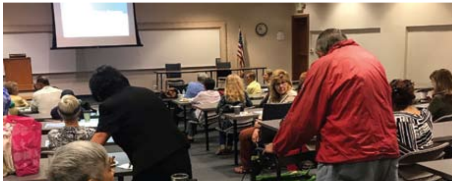
Local Senior Citizens packed room 213.