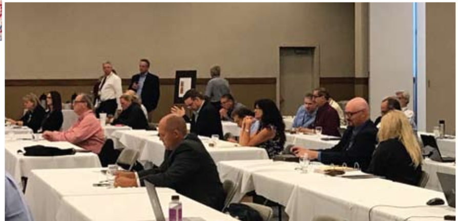
Attorneys and CPA's receive valuable updates in bankruptcy law at the 2019 Bankruptcy Institute