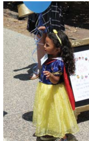
Even princesses were lined up for the cake walk!