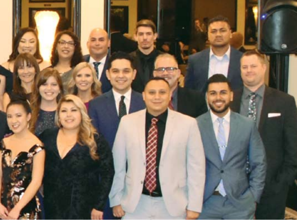
Dozens of SJCL Scholarship winners teamed up for a group shot at the Barristers' Ball.