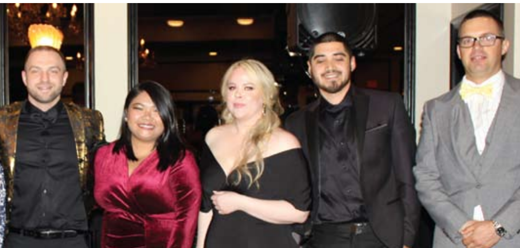
The Staff and Board of the San Joaquin Agricultural Law Review welcome new members.