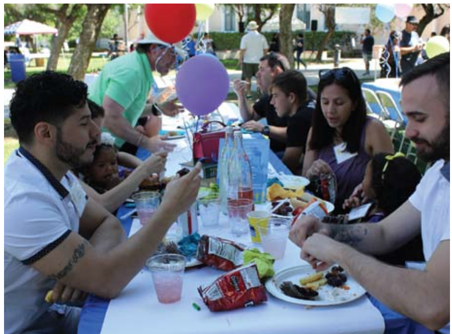
The Clovis Kiwanis grilled up some tasty hot dogs and burgers with extras on the side for a fabulous family picnic in the park.

The Picnic in the Park was the second party/gathering to celebrate the Law School's Golden Anniversary. The next event will take over the entire Law School Building on Friday, October 18th, with different rooms dedicated to the various decades of San Joaquin College of Law, along with free refreshments. Hope to see you there!