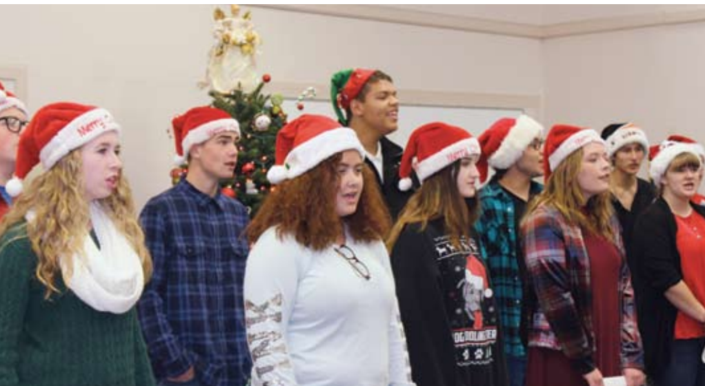
Clovis High Choir led the group in singing a variety of classic Christmas carols