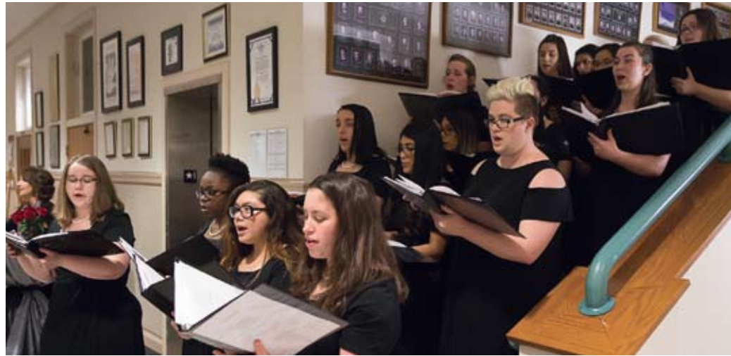
Chorale singers from Fresno Pacific University