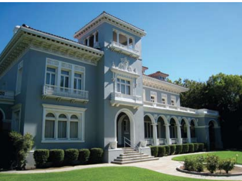
Miles, Sears, & Eanni is located within the historic H. H. Brix Mansion in Downtown Fresno