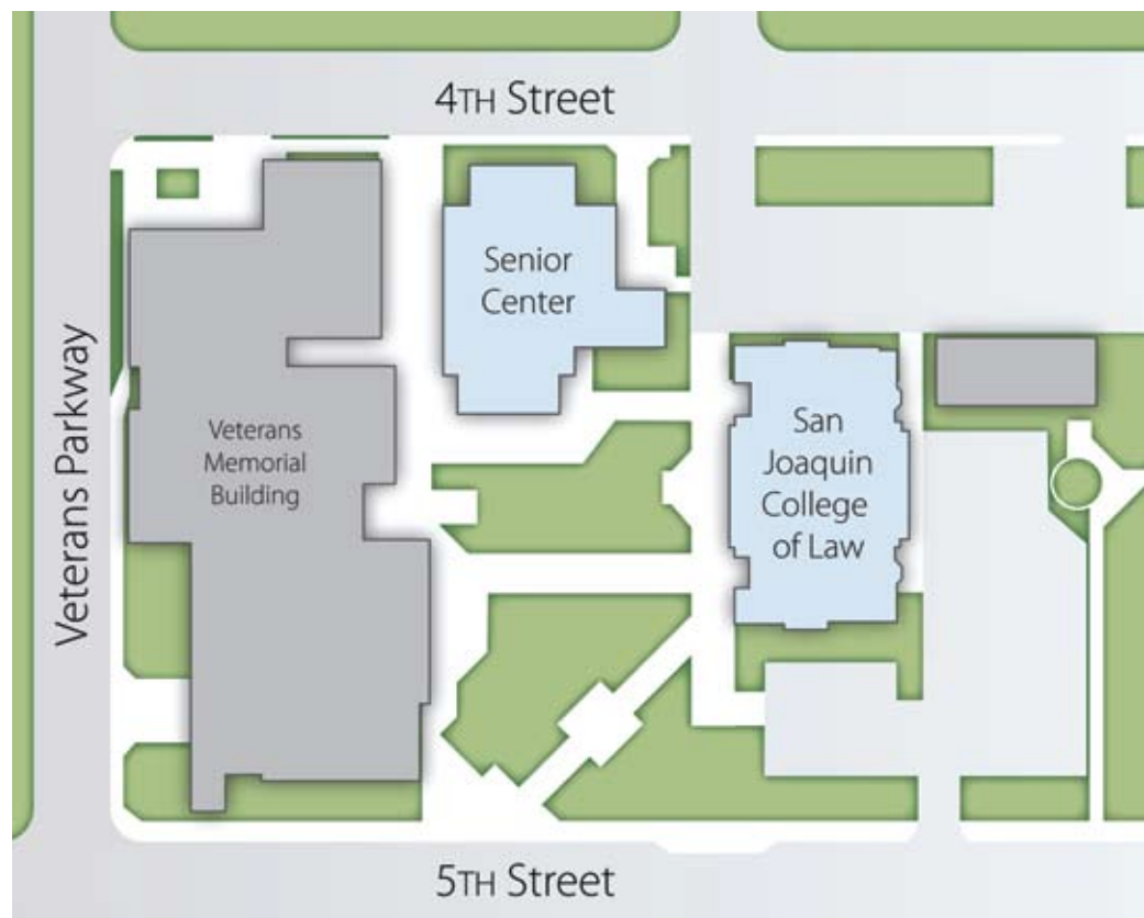
Only a sidewalk separates the current Clovis Senior Center from San Joaquin College of Law as seen in the photo and map above.