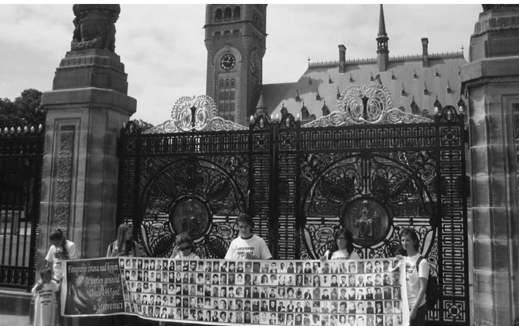
Demonstrations at Peace Palace against accused war criminals.